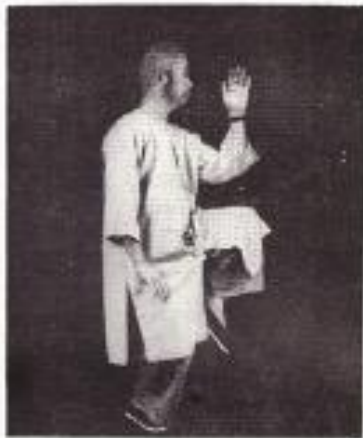
Figure 27. The Golden Parasant Stands on One Leg, Left Style.

For example, we may compare different versions of the same move as illustrated in the manuals of different schools. As it happens, none are found in Qi Jìguang's manual but are great resources for qìgong. A signal move, used to open and conclude its set is unique to Chén Jiagou (and its off-shoot at nearby Zhàobào), except possibly for Sun's 'Crotch Pounding' (Dāngchuí, no. 85). Its title 'Buddha Warrior Presents Club' (Jin'gang Xiànchū) has distinctively Buddhist aspects which may point to a Shàolín origin. It is also known as 'Vajrapāni Pounds Mortar'.